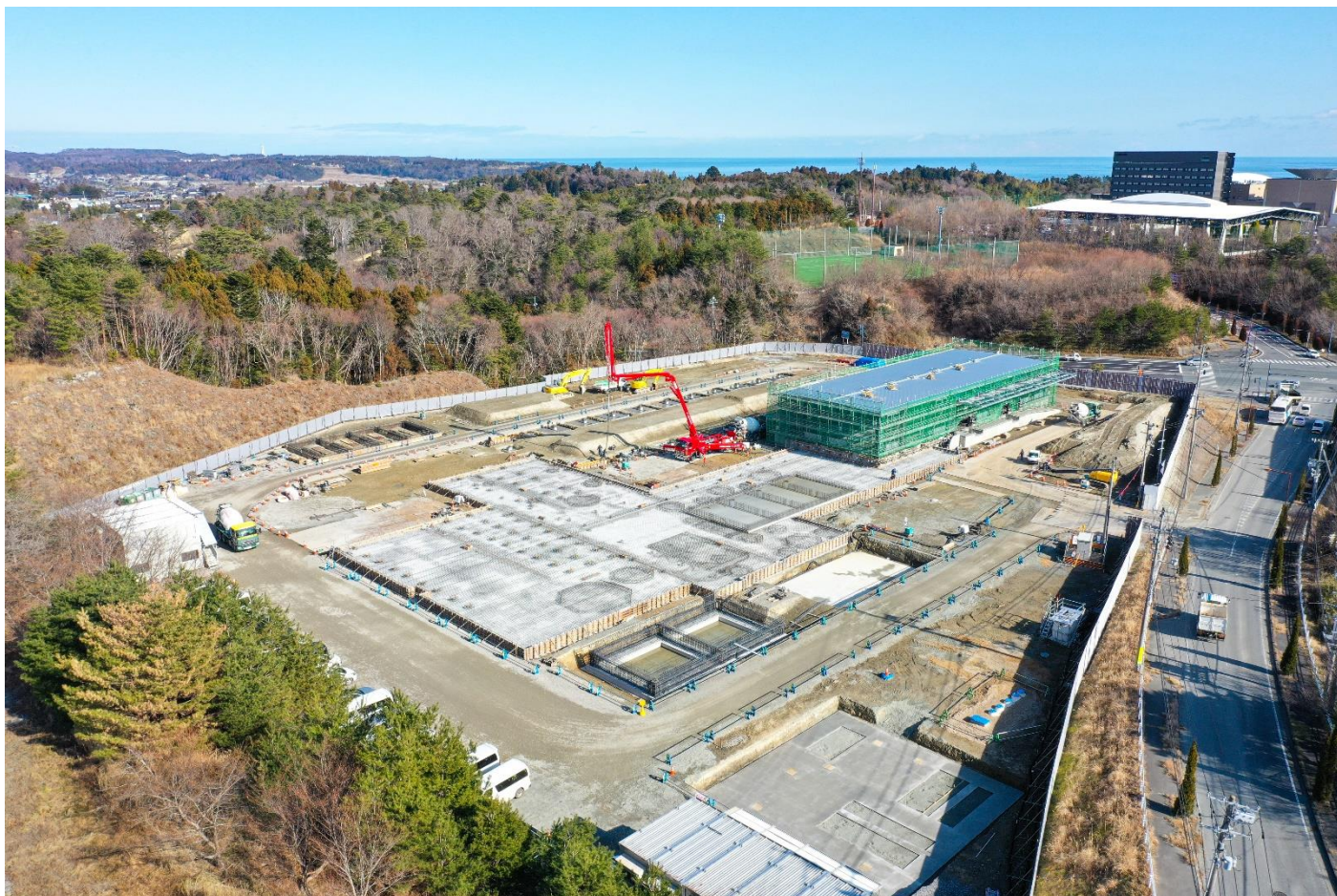
Aerial view of the Naraha Lithium Hydroxide Plant construction site

Discussions are ongoing with the Veolia Joint Venture's plant design engineers with the objective of minimising any impurity sources from plant feed and raw materials entering the plant.